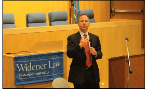
Delaware Gov. Jack Markell addresses the Delaware Campus as part of a one-day conference put on by the Delaware State Bar Association.