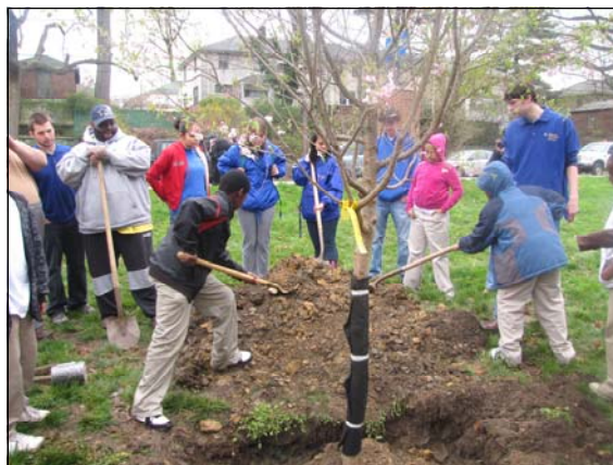
Members of the PSC joined forces with the Chester City Shade Tree Commission to plant a tree and flowers with Stetser Elementary School students.